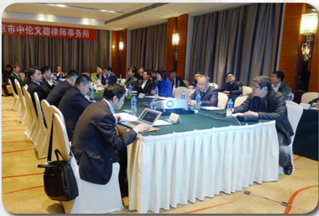
▲ 2016年2月28日，中伦文德在厦门召开集团品牌战略暨业务拓展与合作研讨会。 On February 28, 2016, Zhonglun W&D seminar regarding business development and cooperation was held successfully in Xiamen.