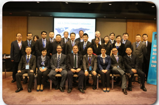
▲ 2016年12月6日,全球法律联盟(Global Legal Alliance)首届全球年会在香港成功召开,吸引了来自世界各地的知名律师事务所及律师。该联盟由中伦文德牵头发起成立,旨在构建全球大中型律师事务所的合作交流平台,共享业务信息,在“一带一路”战略背景下服务中国企业走出去。On December 6, 2016, the first GLA global annual conference was held successfully in Hong Kong, which attracted lots of famous law firms and lawyers from around the world. GLA was established by Zhonglun W&D Law Firm, aiming to develop into a public platform where global legal service providers are able to network, communicate, and cooperate with each other. The initiative “one belt, one road” of GLA will internationalize Chinese enterprises.