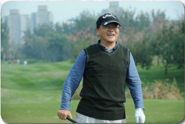
▲ 为感谢中伦文德客户的扶持与相随,中伦文德于2016年11月2日在北京万柳高尔夫球俱乐部举办“中伦文德律师事务所首届秋季高尔夫球友谊赛”。In order to thanks the support and cooperation of clients, on November 2, 2016, Zhonglun W&D held the First Autumn Golf Friendly Match in Beijing Willow Golf Club.