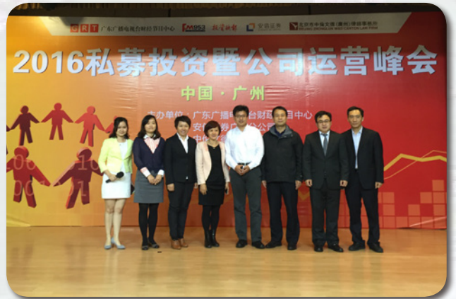
▲ 2016年3月20日，中伦文德广州办公室、广东广播电视台财经节目中心与安信证券广州分公司在广州联合举办“2016私募投资暨公司运营峰会”。 On March 20, 2016, Zhonglun W&D Guangzhou Office, Guangdong broadcasting and TV station financial program center, and Essence Security Guangzhou Branch jointly held 2016 private equity investment and company operation summit in Guangzhou.