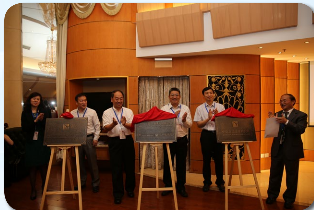
▲ May 23, 2017, Zhonglun W&D established the Zhonglun W&D Law Research Institute, Financial and Investment Development of Xiong'an new district Institute and the Institute of Belt and Road Development Strategy.