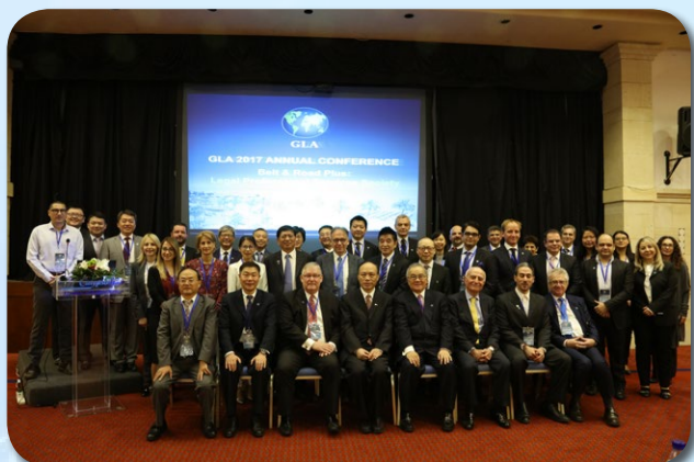
▲ November 20, 2017, Global Legal Alliance (GLA), which was leading established by Zhonglun W&D in 2016, held the annual convention in Cyprus. Lawyers, enterprisers and financier from countries all over the world attended the meeting, talking about new chance and cooperation under Belt and Road.