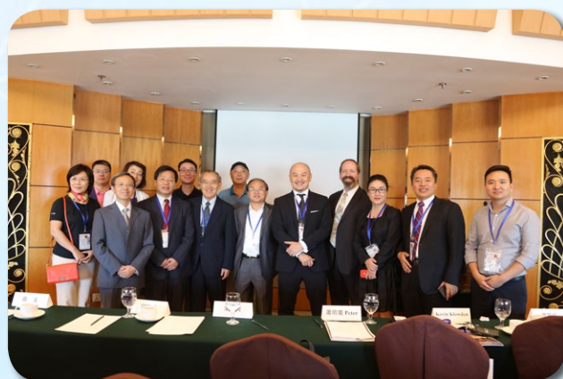
▲ September 19, 2017, Zhonglun W&D, the Institute of Belt and Road Development Strategy, Global Legal Alliance (GLA) and CHINA WEEK: Chinese provinces-California economy and commerce summit co-hosted the seminar entitled "California's role in One Belt One Road and related opportunities" in Beijing.