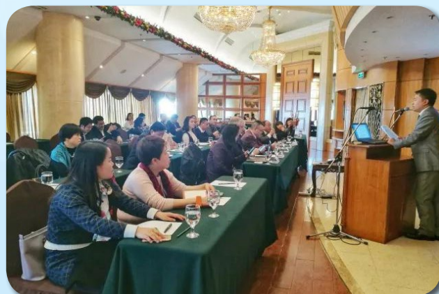
▲ December 19, 2017, Zhonglun W&D, the Institute of Belt and Road Development Strategy and Global Legal Alliance (GLA) co-hosted the seminar entitled "Impacts of Trump's Tax Reform Plan: to American and the world".